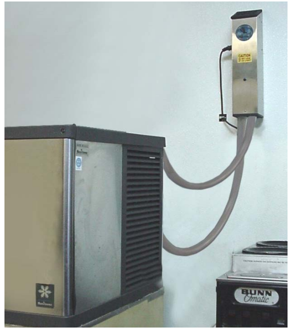
Ice machine odor and bacteria control